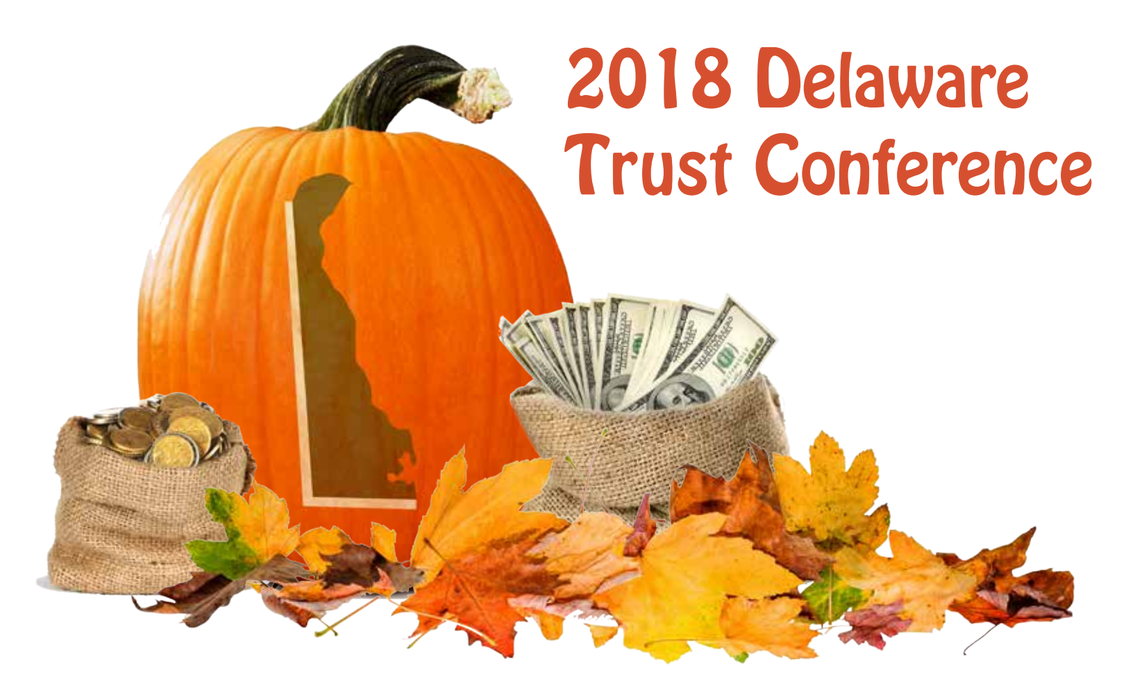
The Tricks and Treats of Delaware Trusts

The Delaware Bankers Association and the Delaware Financial Education Alliance present the 13th Annual Delaware Trust Conference